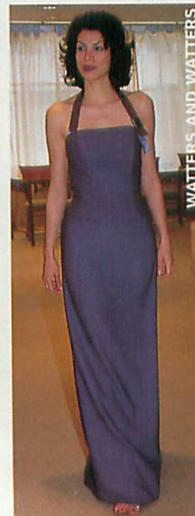
WATERS AND WATTERS