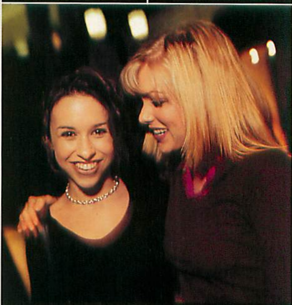
Party of Five's Lacey Chabert with a friend