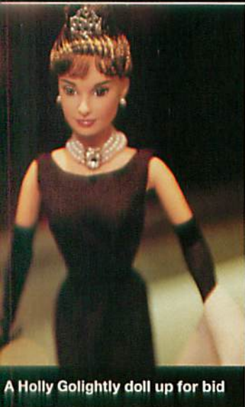
A Holly Golightly doll up for bid